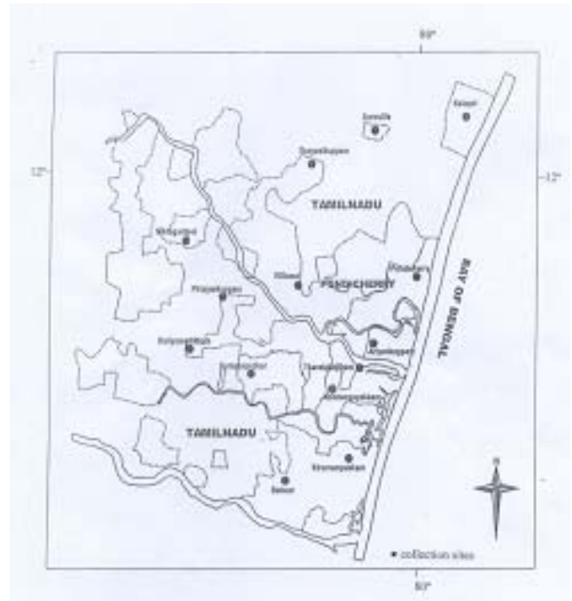
Fig. 1. Map showing collection sites of earthworm species.

The identified earthworm sampling sites in Pondicherry region are depicted (Fig.1). Pondicherry lies at 12°N latitude and 79°E longitude on the east coast of India. The survey and collection was done for two years starting from October 2000 to September 2002. Collections were made twice a month in the following habitats: (i) paddy field, (ii) coconut field, (iii) saline soil area, (iv) municipal solidwaste (MSW) dumped area, (v) groundnut field, (vi) poultry waste dumped area, (vii) vermiculturing area, (viii) cowdung dumped area, (ix) near fresh water bodies, (x) sewage water canals and (xi) industrial area. Collection, preservation and counting of the earthworm species was based on age structure: [(a) juveniles, (b) non-clitellates and (c) clitellates], depth: [(a) epigeic (1 cm to 5 cm depth), (b) anececic (10 cm to 30 cm depth), (c) endogeic (30 cm to 50 cm depth)] and habitat following Ghosh (1993), Ismail (1997) and Jimenez et al. (2000). Species richness and diversity of species