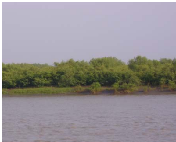
Fig. 2. An overview of mangroves at an island of Purna Estuary.

C.B. Roinson and Bruguiera cylindrica (L) Bl. plants are present on the intertidal mudflats and behind fringe patches of Avicennia marina . Rhizophora mucronata Lam. is present dispersed along the intertidal mudflats. Plants of Aegiceras corniculatum (L.) Blanco were found on the edge of a creek. Small saplings of all the mangrove species were observed in large numbers except for Aegiceras corniculatum which indicates the good regeneration status of the mangrove vegetation.