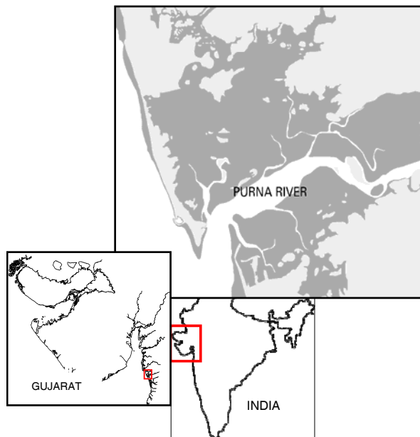
Fig. 1. Location map of the study area.