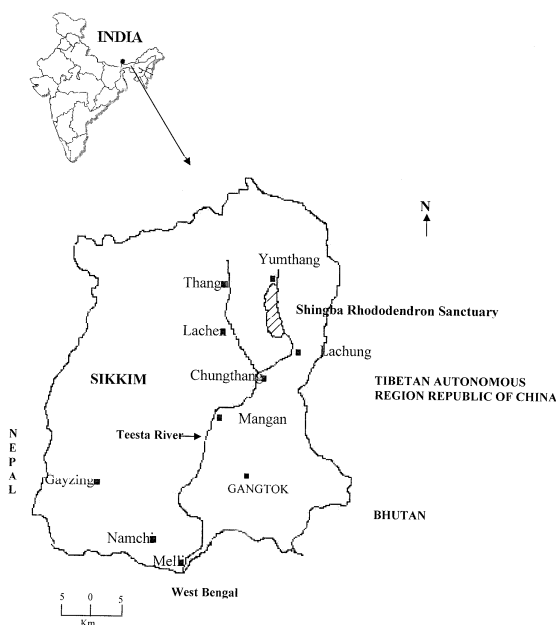
Fig. 1. Sikkim showing Shingba Rhododendron wildlife sanctuary (hatched area) and other important locations.

48 % area of the sanctuary (Delhi University 2006). The climate is cold and temperate. Temperature remains negative during winter (December-March) but rises during rest of the year with maximum of 15 °C during May. Rainfall varies from 800 mm to 1400 mm annually and begins from May-June and continues till the end of September. Precipitation in winter occurs in the form of snow.