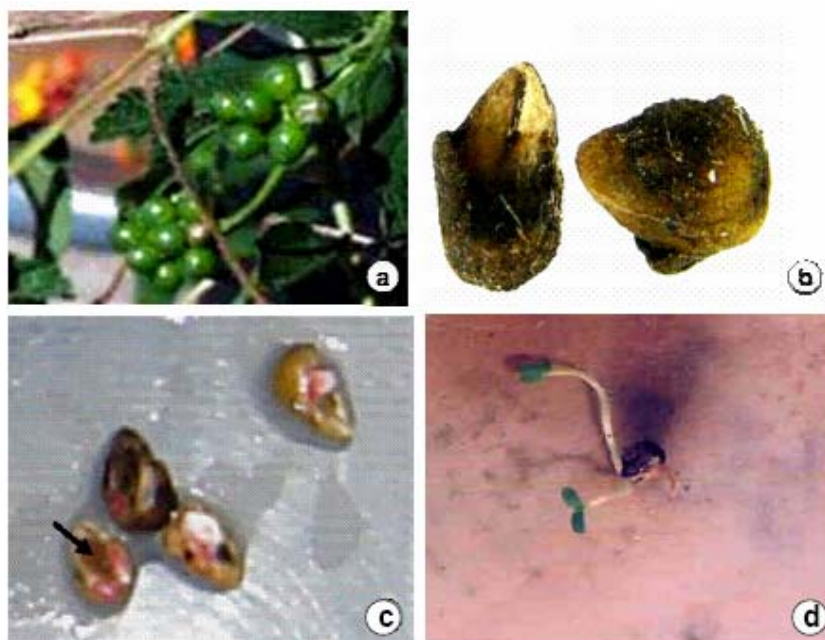
Fig. 1. Unripe fruits (a), de-pulped seeds (b), sectioned seeds showing TTC-stained pink viable embryos (c), and double recruitment from a single seed (d) in Lantana camara .